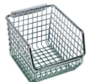
Wire Mesh Bins