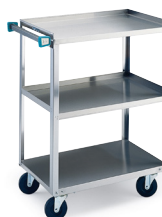
Stainless Steel Carts