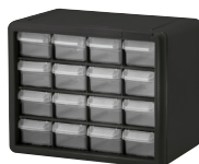
Bin Storage Cabinets