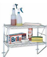
Wall Mount Shelving